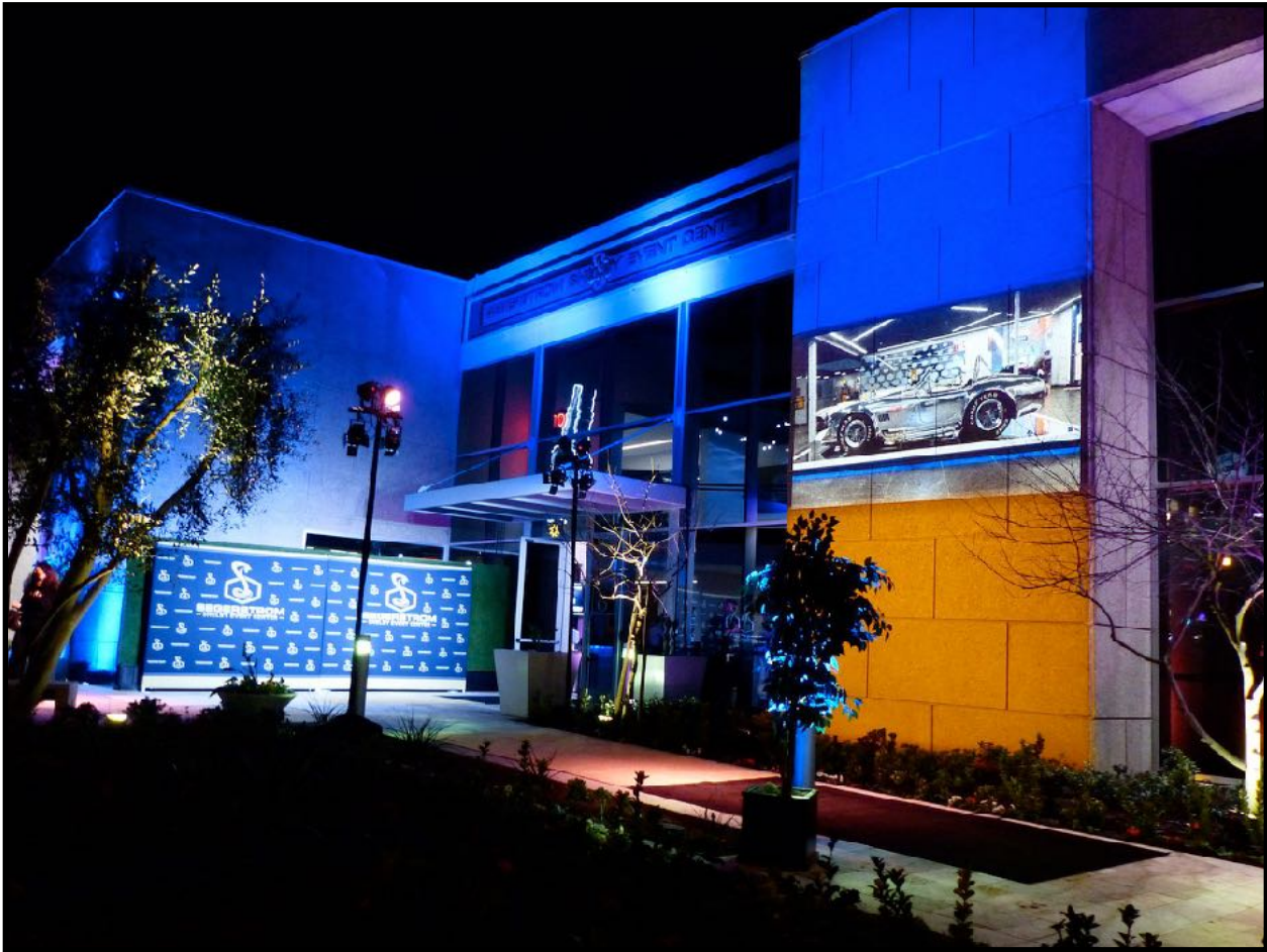
Segerstrom Shelby Event Center