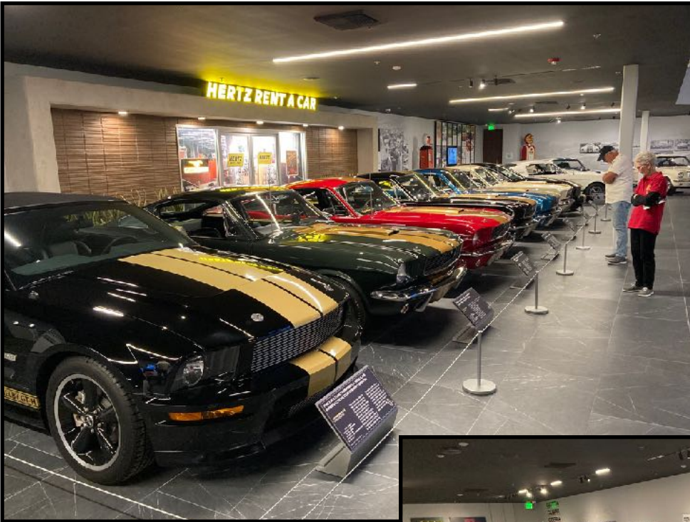
Shelby Mustangs made for Hertz - all have a gold stripe on the hood.