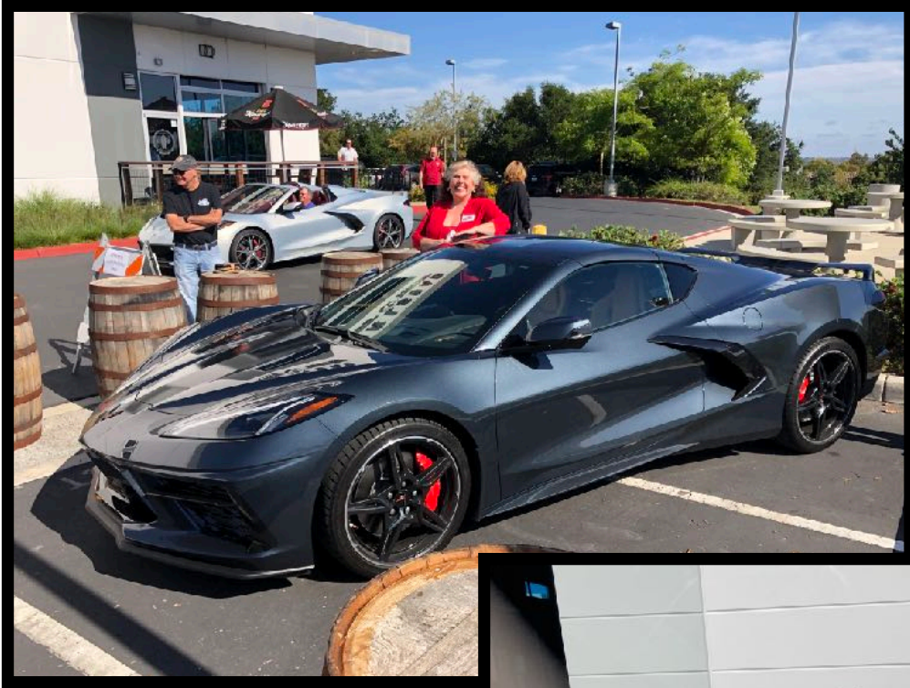
Carlsbad Brewing Company owner's C8