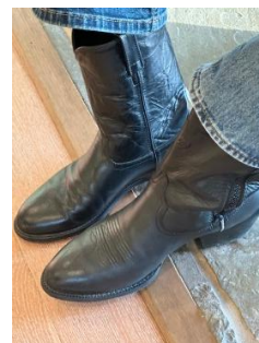
Cary and Carm's black leather