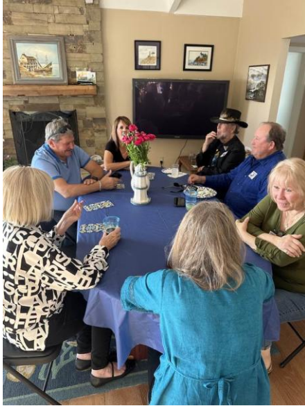
Novice Table #1