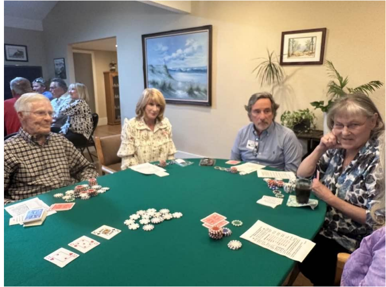
Novice Table #2