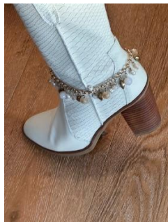
Nan's glitzy cowgirl