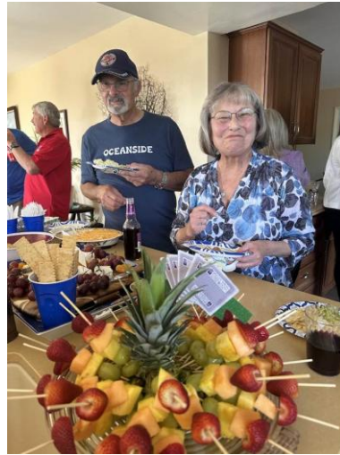
lots of goodies to share