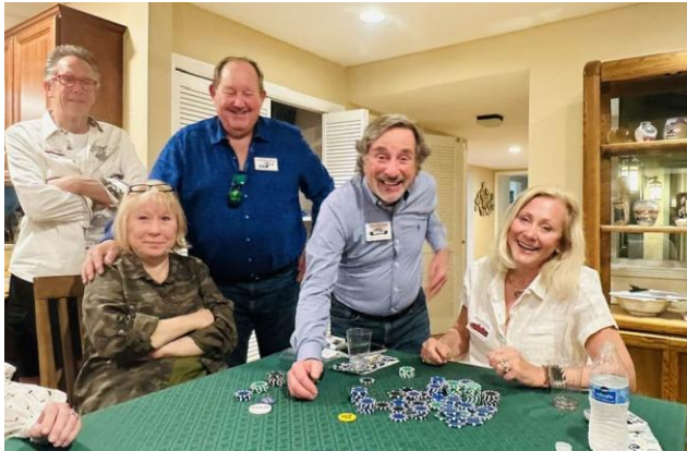
The Final Seven Table . . .