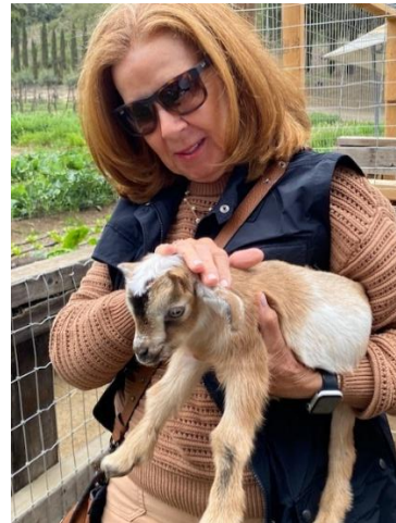
Looking at a kid