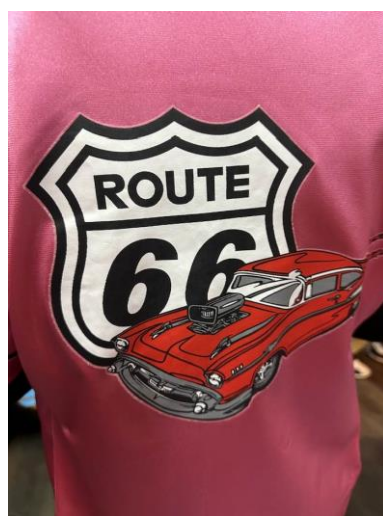
and her bowling shirt . . .