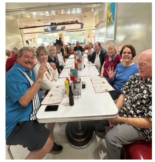
Who knew Ruby's had room to host a Happy Hour for North Coast Vettes?