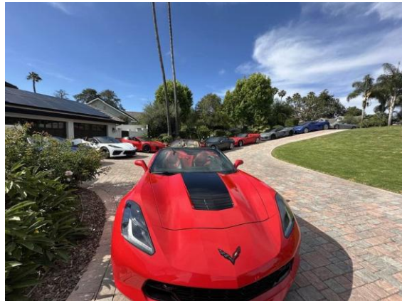
... and the cars ...