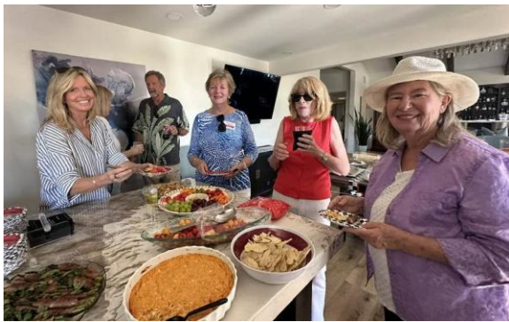
Lots of goodies to enjoy